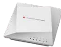
ACERA (ACERA 1210)