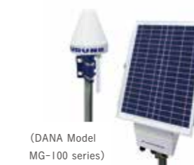
(DANA Model MG-100 series)

We are developing businesses globally that contribute to the maintenance of the environment in our daily lives by integrating the knowledge, experience, skills, and know-how we have cultivated in our business activities with technologies that "challenge the invisible" and FURUNO's core technologies of sensing, processing, and communication.